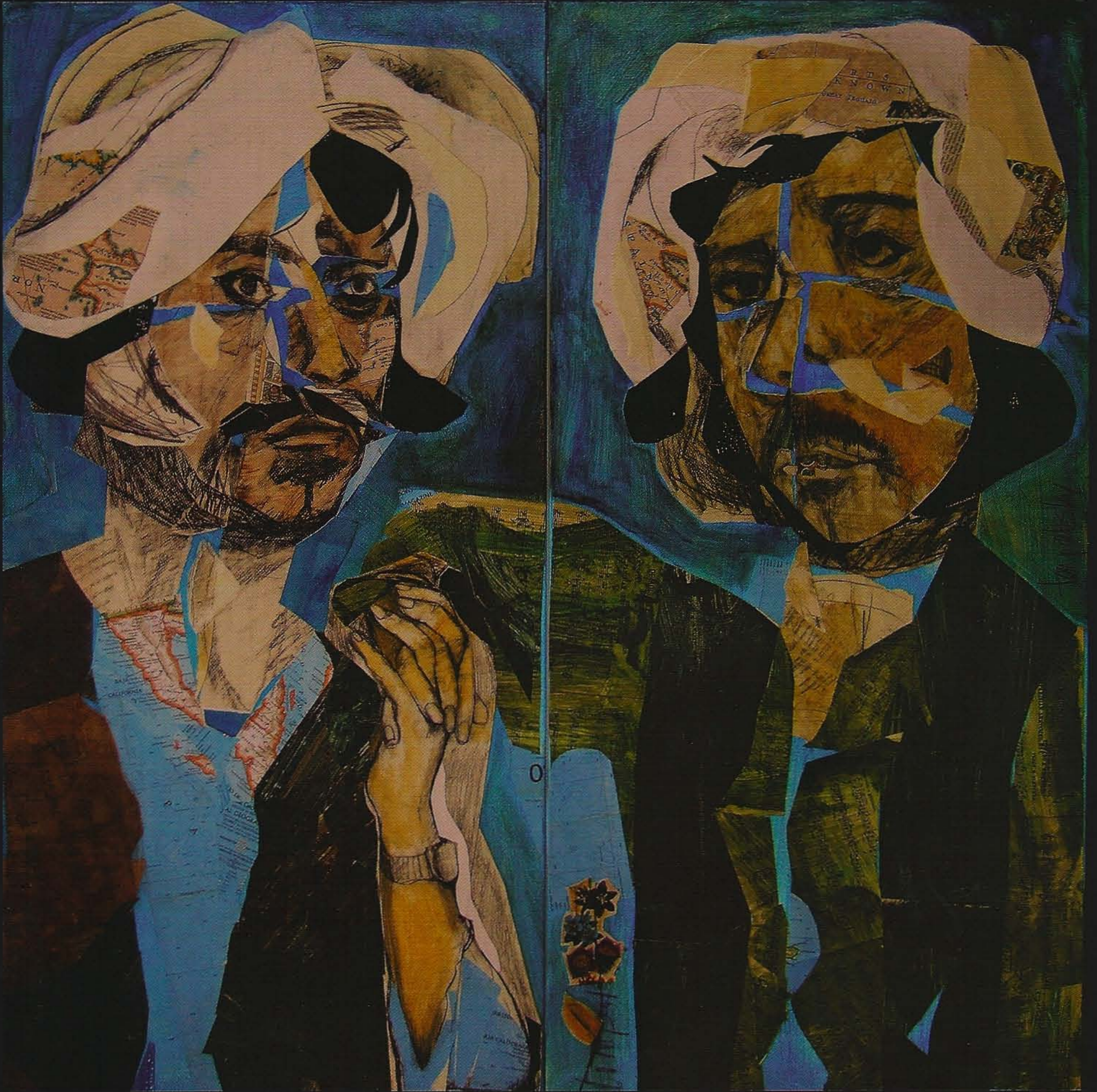
Identification and Assertion of Preferences, Mixed-Media, 40 x 40"